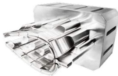
MULTI-PART HORN FOR LARGE COMPONENTS

The right device for every application. We provide you with tailored technology. Contact us and we will be happy to advise you.